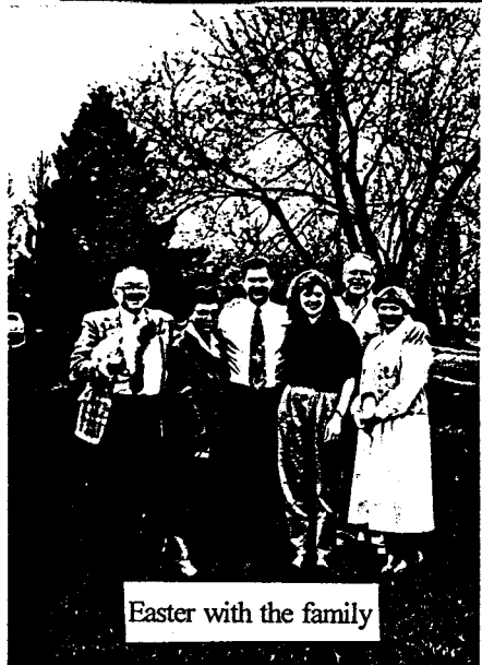
Easter with the family