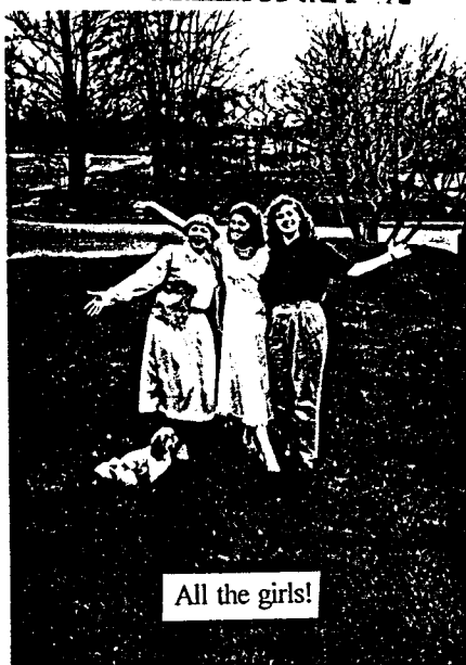
All the girls!