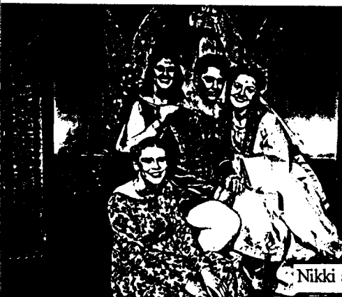
Some of the cast from Much Ado About Nothing