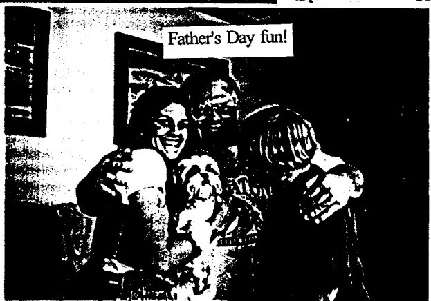
Father's Day fun!